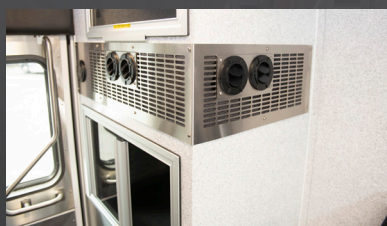
SECOND EVAPORATOR AND COMPRESSOR FOR EXTRA COOLING CAPABILITIES