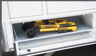
HORIZONTAL STAIRCHAIR STORAGE ON THE STREET SIDE OF MODULE