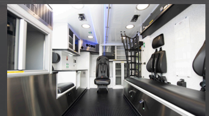
SPACIOUS INTERIOR DESIGN