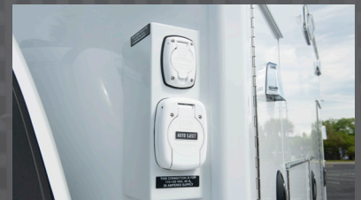
ANGLED SHORELINE ON THE FRONT OF THE MODULE FOR EASIER ACCESS